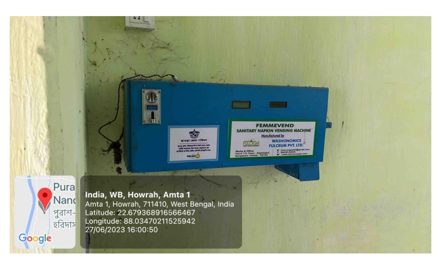
Sanitary Napkin Vending Machine